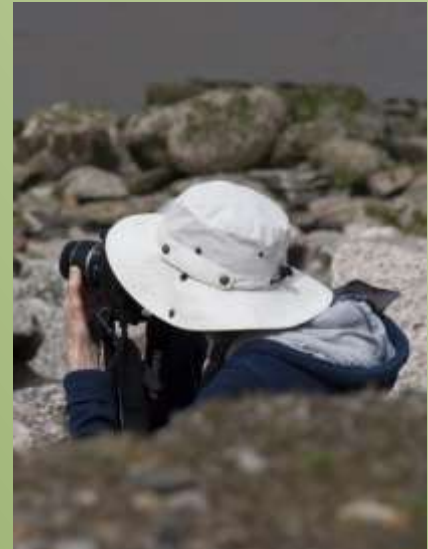
Lesser Spotted Photographer (Ann-Marie Metcalfe)