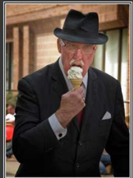
3rd - Iced Pleasure by Chris Noble