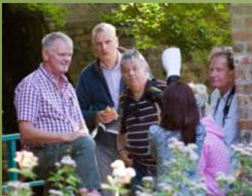
Getting In Closer