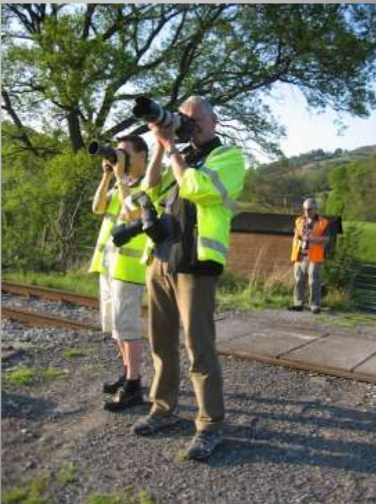
Boys And Their Toys