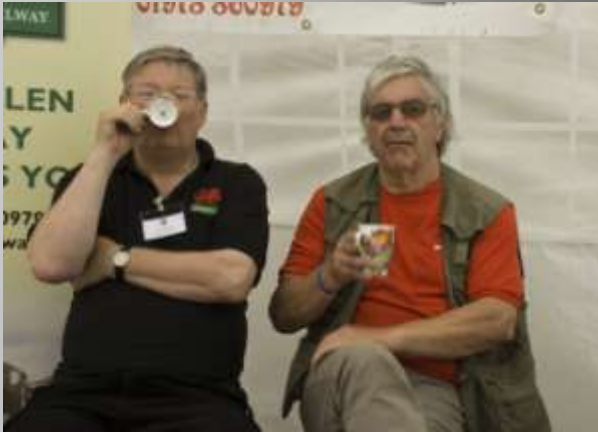
Tea Break At The Llangollen Festival