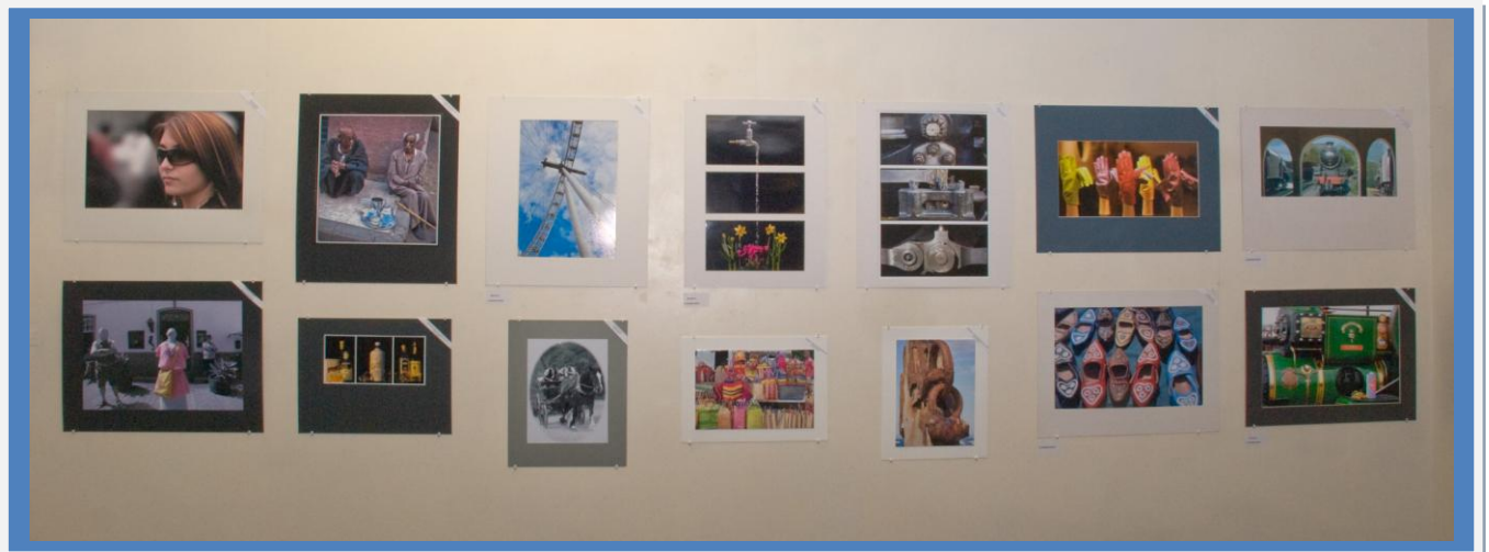
Below: Part of the Buckley Library Exhibition